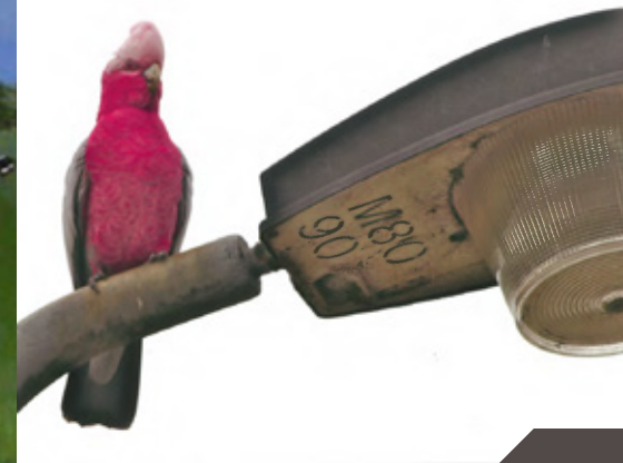
Birds of Casey - The Humble Galah by Alan Barrett