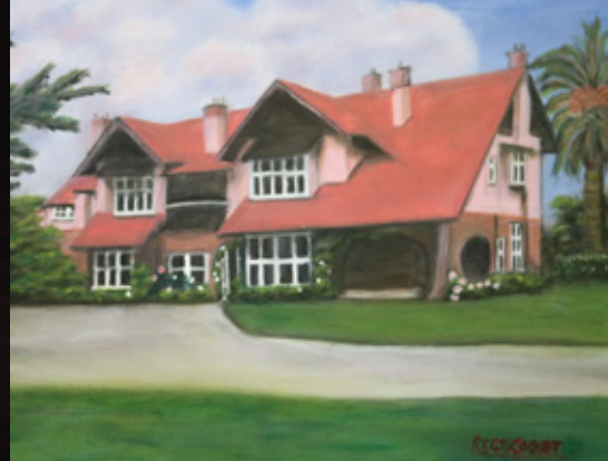
Edrington House by Regis Coquet