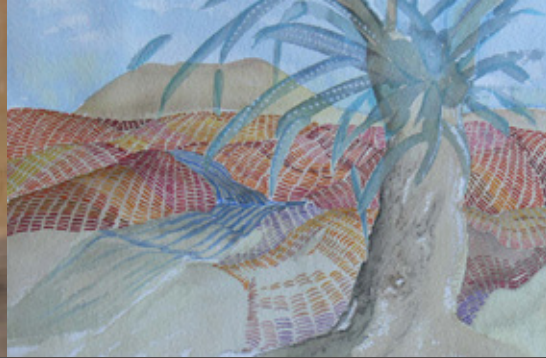
Landscape by Dorothy Cole