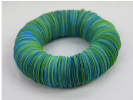
Untitled 2 by Lana Blow