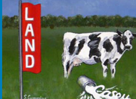
Casey Pastures by Sue Cummins in Patmos' Here and Now